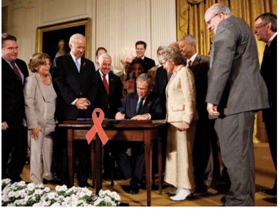
Senator Lugar watches President Bush sign into law the President's Emergency Plan for AIDS Relief (PEPFAR).

be based on aood intentions. Accordingly, they designed a system that would prevent power from accumulating in a few hands. But they knew efficient that the operation of such Republic would require most elected officials to have a dedication to governance, and they trusted that leaders would arise in every era to make their vision work.