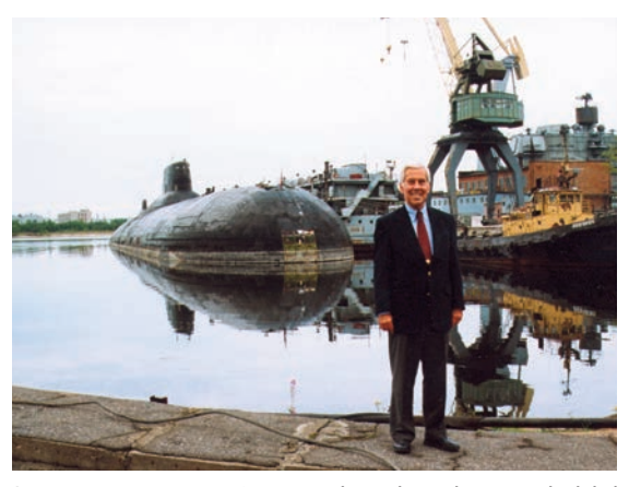
Senator Lugar examines a Russian Typhoon class submarine scheduled for dismantling as part of the Nunn-Lugar Cooperative Threat Reduction Program.

The Lugar Center (TLC), a 501 (c) (3) organization located in Washington, DC, was established in 2013 as a platform for an informed debate on national and global issues. The Center is designed to be a prominent voice on issues that framed much of Senator Lugar's career. It seeks to educate the public, global policymakers, and future leaders on critical issues such as the non-proliferation of weapons of mass destruction, food security, foreign aid effectiveness, and bipartisan governance.