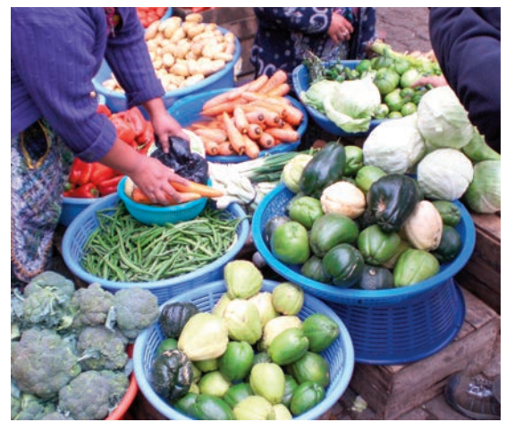
Small holder farmers benefit from access to markets.

In order to meet the 2050 challenge in ways that benefit all people, regardless of their place of birth, cultural or religious heritage, gender or economic status, we must recognize the value of differing approaches and seek to accommodate those approaches in ways that make sense. In some cases will this entail low technology solutions; in other cases it will involve the use of GMOs.