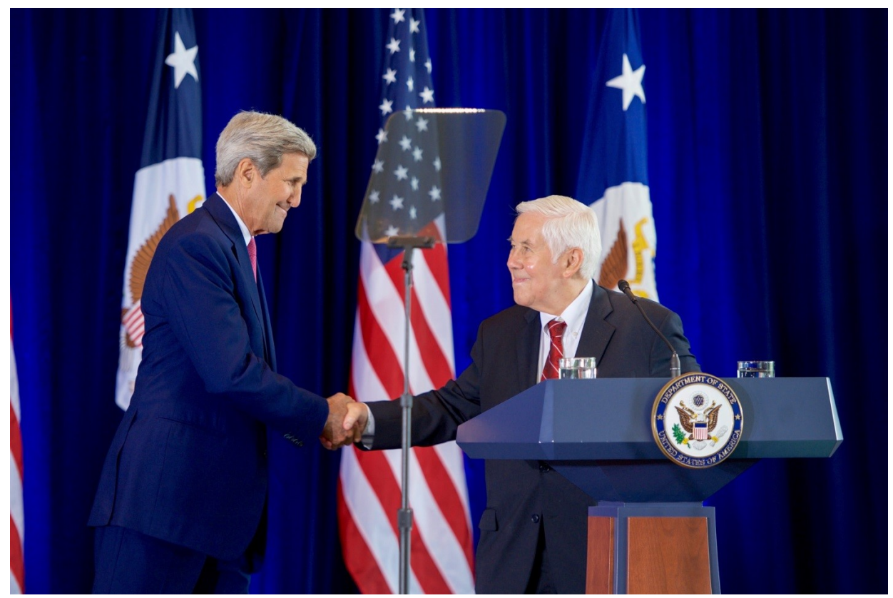
In September 2015, Senator Lugar and Secretary of State John Kerry argued for the implementation of the Iran nuclear agreement at the National Constitution Center in Philadelphia.