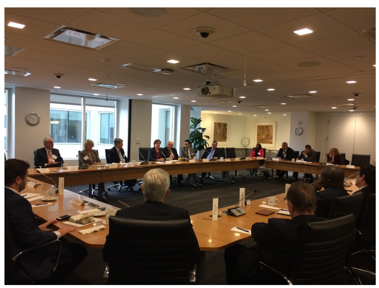
Ambassadors representing nations from across the globe, together with TLC sponsors, participate in the Lugar Diplomacy Series with guest speaker, U.S. Supreme Court Associate Justice Elena Kagan.

2016 proved to be a pivotal year for The Lugar Center, with the challenges of national political campaigns and the transition to a new administration and Congress that is less knowledgeable of the roles of foreign assistance, global food security, and non-proliferation in national security. At the same time, 2016 offered opportunities for Congress to endorse sound aid approaches in legislation on aid effectiveness, global food security, and energy. TLC was able to work with NGOs and other think tanks to educate