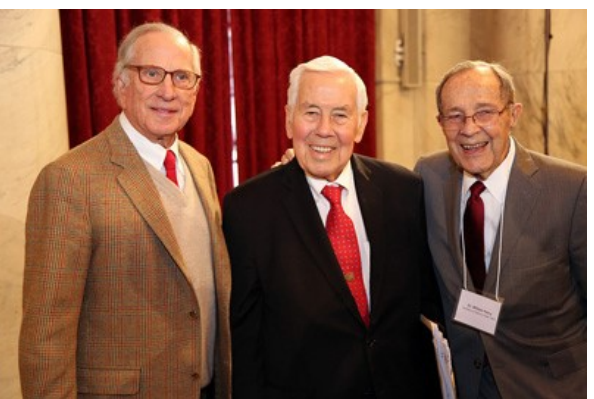
2016 marked the 25<sup>th</sup> anniversary of the Nunn-Lugar Cooperative Threat Reduction Program. Secretary of Defense Ash Carter hosted a recognition ceremony at the Pentagon where he dedicated the Secretary's conference room in honor of Senators Nunn and Lugar. At the Capitol, the Carnegie Corporation, The National Security Archive, and the Nuclear Threat Initiative hosted panels discussing the successes of the program