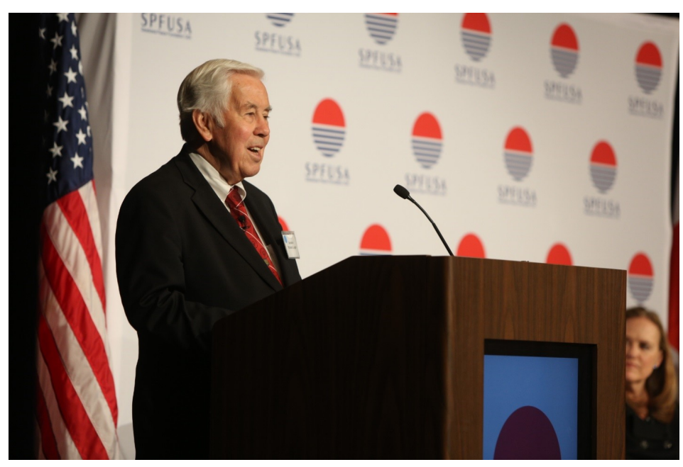
Senator Lugar addressed the Sasakawa Peace Foundation's US-Japan Security Forum in April 2015.