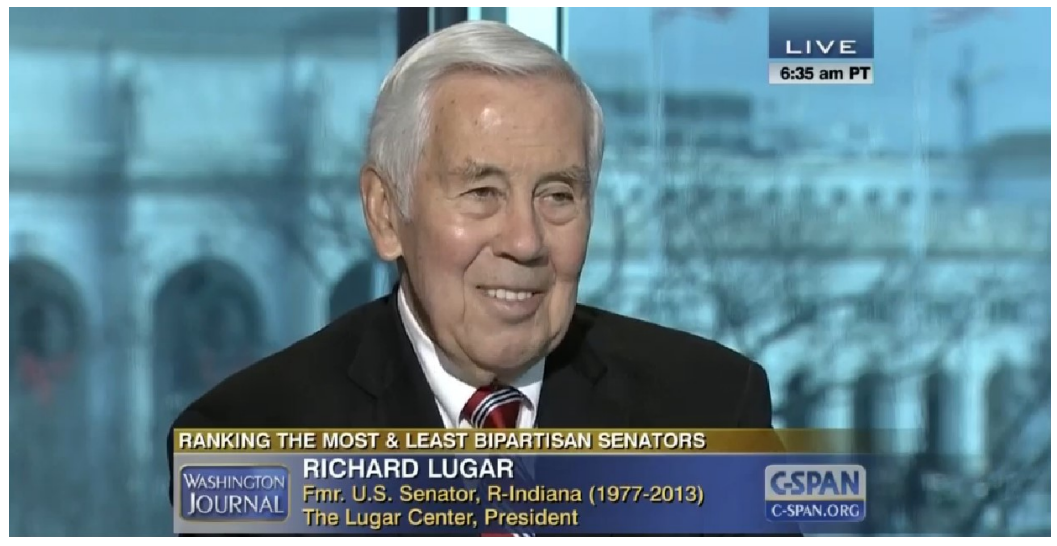
Senator Lugar explains the Bipartisan Index on C-SPAN in January 2016.

and Representatives during 2015, the first session of the 114th Congress. This garnered considerable national publicity when reporters noted that two presidential hopefuls in the 2016 primaries at the time, Sens. Ted Cruz (R, TX), and Bernie Sanders (I, Vt.) ranked last on the Index as the two least bipartisan Senators. Local media around the county produced pieces on how members of Congress from their regions scored on the Index, and Sen. Lugar and staff gave several media interviews. In October 2016, TLC published an analysis showing that voters in the most partisan congressional districts can nonetheless elect bipartisan representatives.