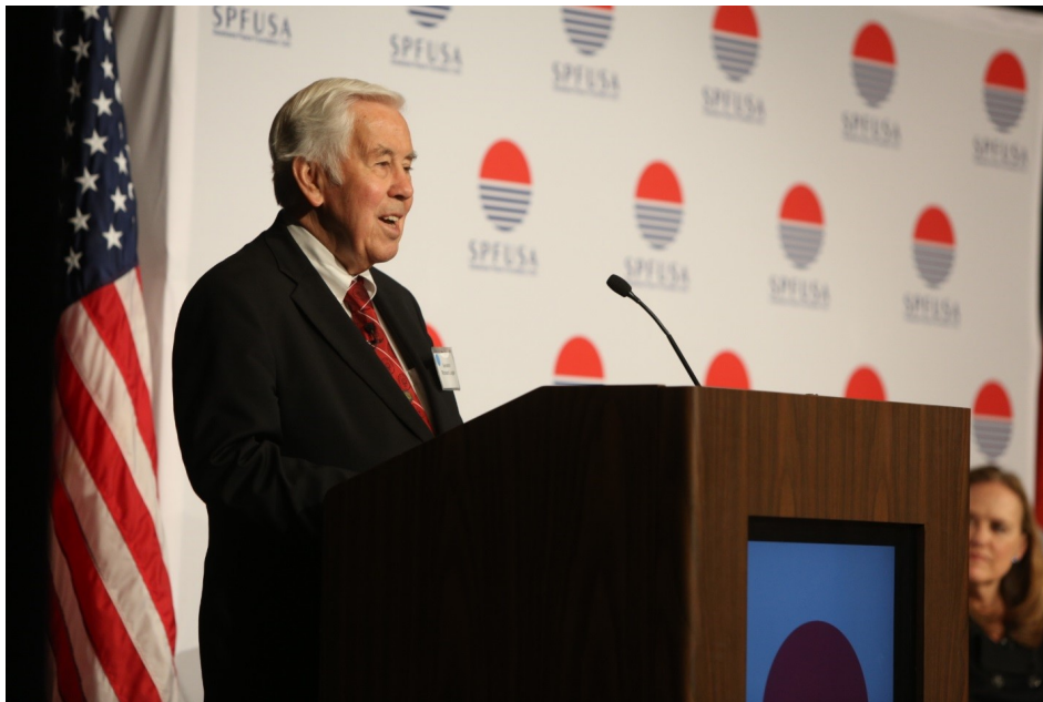
Senator Lugar addressed the Sasakawa Peace Foundation's US-Japan Security Forum in April 2015.