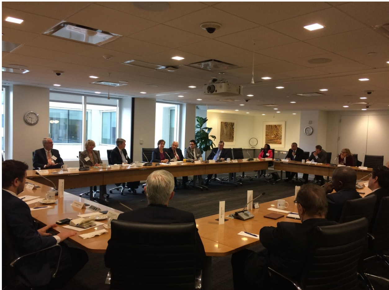
Ambassadors representing nations from across the globe, together with TLC sponsors, participate in the Lugar Diplomacy Series with guest speaker, U.S. Supreme Court Associate Justice Elena Kagan.

2016 proved to be a pivotal year for The Lugar Center, with the challenges of national political campaigns and the transition to a new administration and Congress that is less knowledgeable of the roles of foreign assistance, global food security, and non-proliferation in national security. At the same time, 2016 offered opportunities for Congress to endorse sound aid approaches in legislation on aid effectiveness, global food security, and energy. TLC was able to work with NGOs and other think tanks to educate