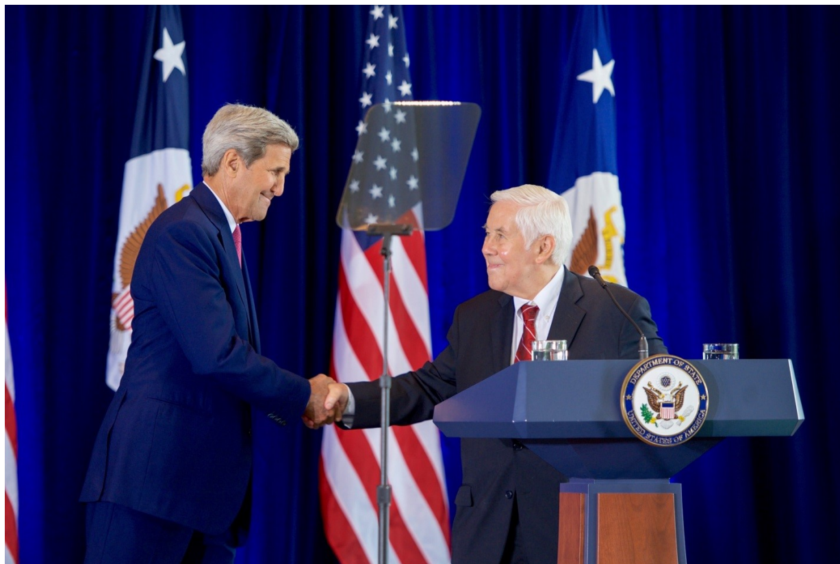
In September 2015, Senator Lugar and Secretary of State John Kerry argued for the implementation of the Iran nuclear agreement at the National Constitution Center in Philadelphia.