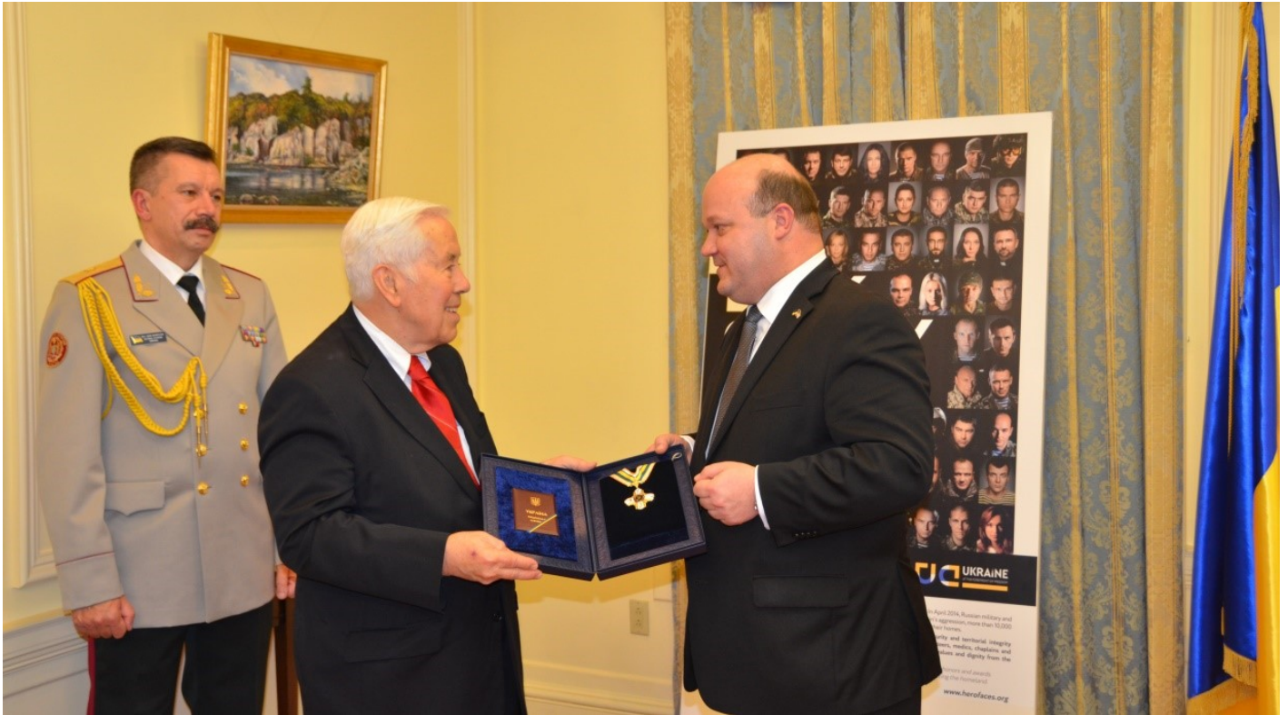
Senator Lugar was awarded the Ukrainian Order of Liberty by President Petro Poroshenko for his efforts to strengthen the sovereignty and independence of Ukraine. The honor was presented by Ambassador Valeriy Chaly in December 2016.

Finally, our principal, Senator Richard G. Lugar, plays an active, hands-on role both within TLC and among the Washington and global foreign policy communities. Over these past two years he has been invited to lead and keynote policy conferences and meetings and continues to be recognized for his leadership in foreign policy.