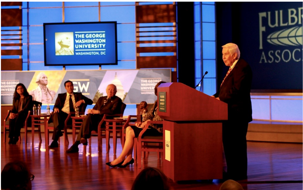
In November 2016, Senator Lugar received the Fulbright Prize for International Understanding and addressed the Fulbright Association's Annual Conference in Washington. The prize recognizes "outstanding contributions toward bringing peoples, culture, or nations to greater understanding of others." The first recipient of the award was former South African President Nelson Mandela, and others include former President Jimmy Carter, former U.N. Secretary General Kofi Annan, and Bill and Melinda Gates.

In the fall of 2016, TLC began a new program that brings in prominent American thought leaders for roundtable discussions with the international diplomatic corps stationed in Washington. Former Iraq and Afghanistan commander and CIA director General David Petraeus (ret.) and U.S. Supreme Court Associate Justice Elena Kagan were the first speakers for the program, with Senator Susan Collins (R-ME) and philanthropist and global agriculture expert, Howard Buffett, presenting in early 2017. These roundtables present valuable opportunities to discuss foreign policy and development issues with ambassadors who often return to their home countries to take up even more influential positions.