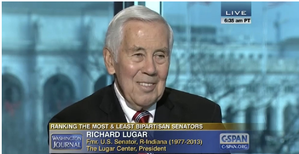
Senator Lugar explains the Bipartisan Index on C-SPAN in January 2016.

and Representatives during 2015, the first session of the 114th Congress. This garnered considerable national publicity when reporters noted that two presidential hopefuls in the 2016 primaries at the time, Sens. Ted Cruz (R, TX), and Bernie Sanders (I, Vt.) ranked last on the Index as the two least bipartisan Senators. Local media around the county produced pieces on how members of Congress from their regions scored on the Index, and Sen. Lugar and staff gave several media interviews. In October 2016, TLC published an analysis showing that voters in the most partisan congressional districts can nonetheless elect bipartisan representatives.